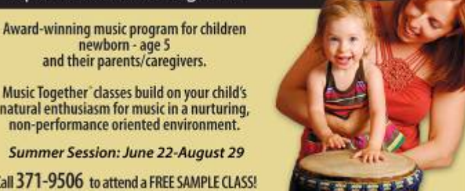
2700 W. Anderson Lane, Ste. 320 Austin, TX 78757 www.heartsongmusictogether.com